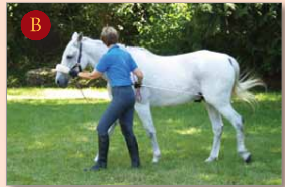
(A) Shoulder Press: as you press the shoulder lightly with a softly closed fist, keep your own knees, hip joints and back soft and released. This is not a “pushing” exercise, and if your body is tight the horse will respond in kind with tightness and bracing. The most important part of this exercise is the slow release of pressure, as this is when the horse finds his own self-carriage and his own sense of balance without having to brace. (B) You can also practice Shoulder Press while walking.

The first exercise is Shoulder Press . While standing or walking alongside your horse, make a fist with your hand closest to his body and press in gently into the fleshy part of his shoulder muscle about two and a half fist widths behind the point of the shoulder.